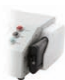
Battery Adapter Fully integrated with the recorder