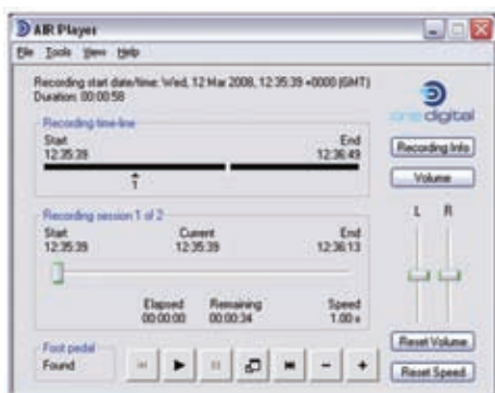
User display interface