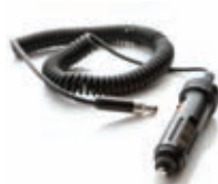
Vehicle Battery Cable For in-vehicle recording