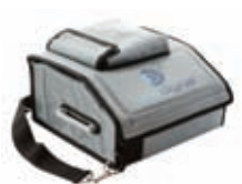
Carrying cases A choice of lightweight or heavy duty carrying cases