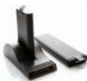
Batteries & Charger Batteries to allow up to 5 hours record time Mains desktop chargers