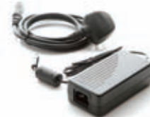
Mains power cable UK and International Power Cables